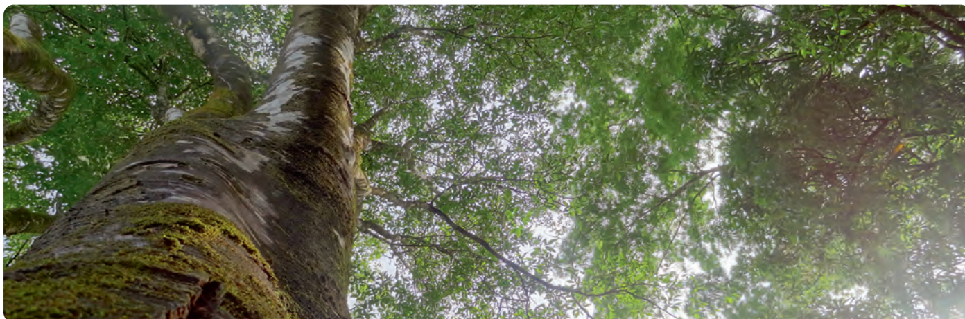
Since 1995 areas in Panama are being afforested, as on the finca „Madera Fina“ in Chiriquí.

High quality carbon credits derived from the reforestation of mixed forests