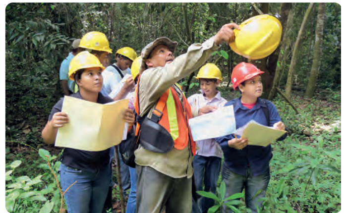
Environmental programmes, such as a forest education trail for schools, are an integral part of the project.